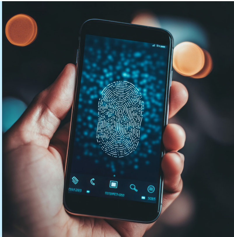
Figure 1 – Common attributes of digital identity systems

Digital identity is a representation of an individual that provides for the legal equivalence of in-person identity validation, authentication, authorisation, and signature time-stamping. A digital identity uses trusted data from an authoritative source to initially verify an individual's identity and then authenticate that individual each time their identity is used. A good digital identity system is formed from components that work together to ensure security, usability and privacy. See Figure 1 for some commonly recognised attributes of digital identity systems. Fuller descriptions for the attributes are provided in Appendix 1 .